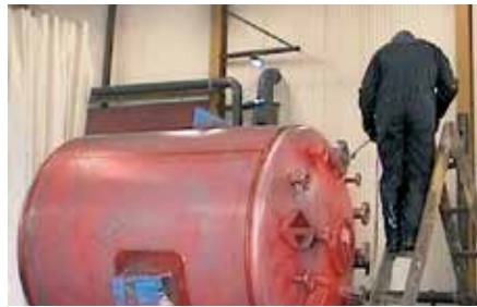
RedOne™ Pickling Spray 240