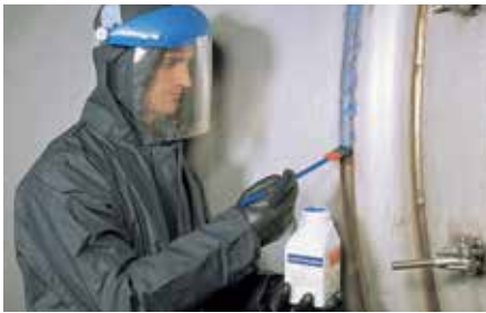
BlueOne™ Pickling Paste 130