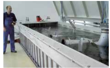
Pickling Bath 302